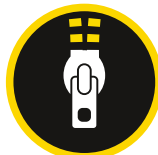
YKK MAIN ZIP LIFE TIME WARRANTY