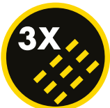
TRIPLE STITCHED SEAMS