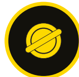
NON-SCRATCH HEAVY DUTY FIXING STUDS